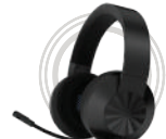
Legion H600 Wireless Headset + S600 Headset H600 Wireless Headset Stand