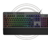
Legion K300 Mechanical Keyboard