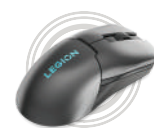
Legion M600s Qi Wireless Gaming Mouse