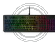
Lenovo Legion K300 Keyboard