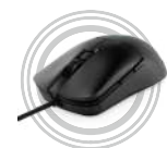
Lenovo Legion M300 Mouse